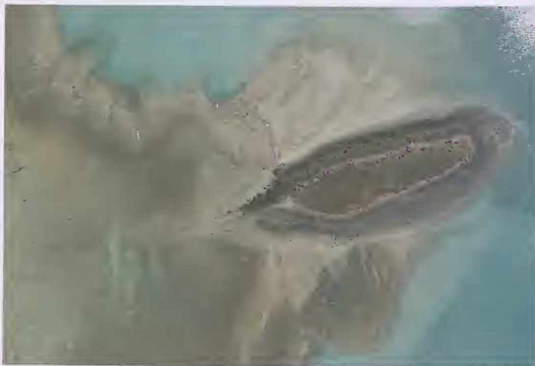
Figure 4. Wulajarlu Island on the rim of the upper lagoon of Montgomery Reef where it impinges on the reef-front without a lower reef flat. This island is built of Paleoproterozoic quartz sand stone and conglomerates and there is no dolomite.